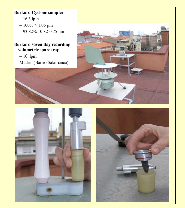
Fig. 1. Hirst-type volumetric trap and Burkard Cyclone samplers. Particles were collected directly into a 1.5 mL Eppendorf vial.

Hirst-type volumetric trap and Burkard Cyclone samplers were used for pollen counts and aeroallergen capture, respectively. The quantification of Ole e 1 allergens was performed using specific 2-site antibody ELISA (Bial; Bilbao, Spain).